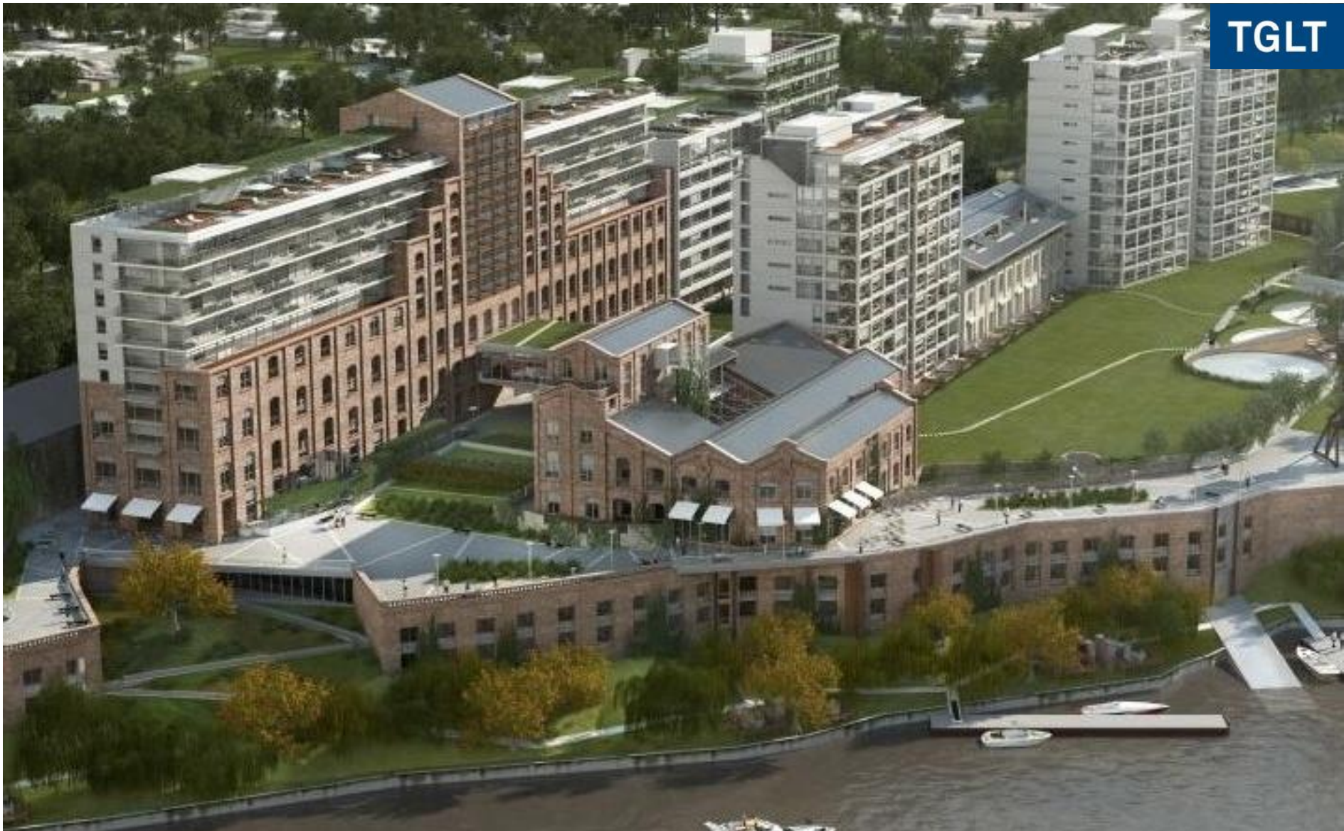
Forum Puerto Norte / Rosario, Santa Fe / 52,639 sqm