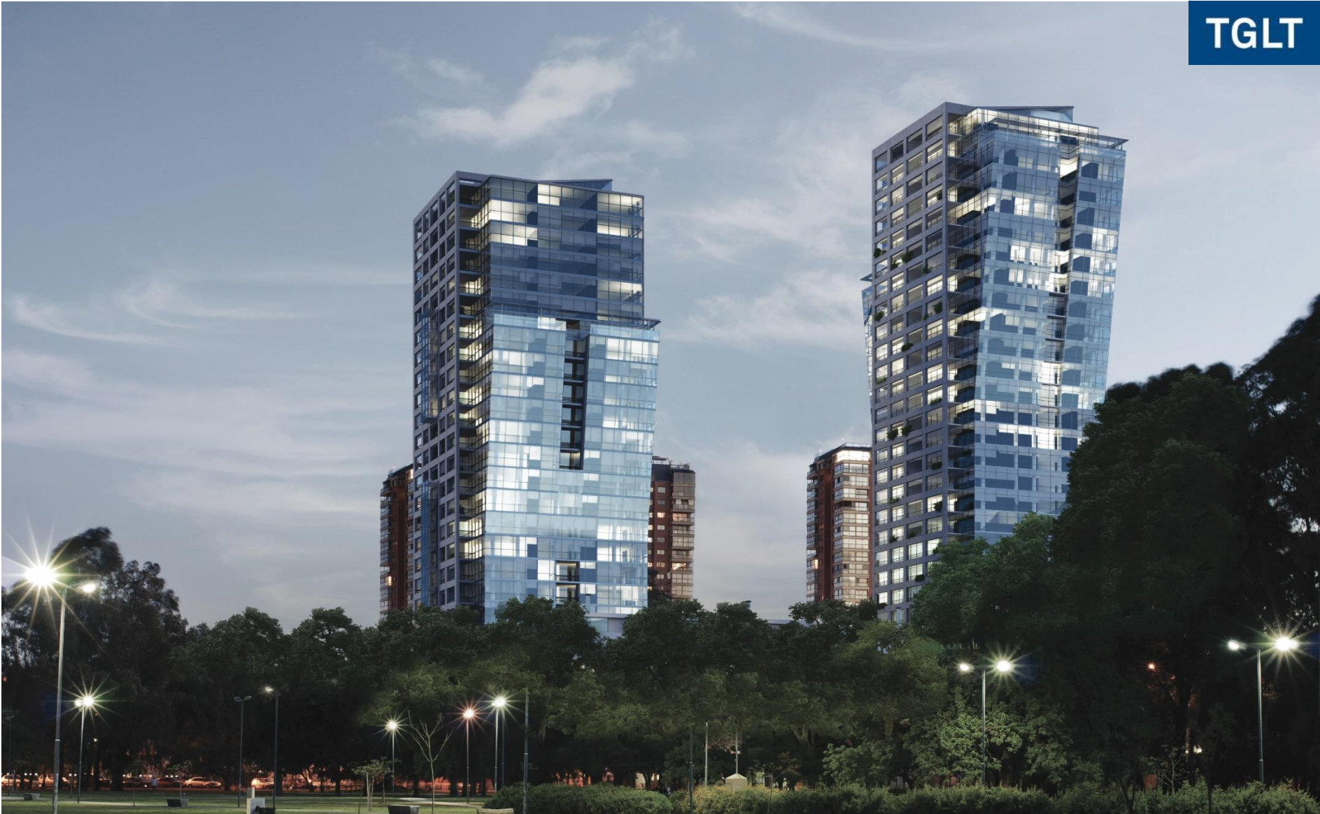
Forum Alcorta / Bajo Belgrano, Buenos Aires / 39,763 sqm